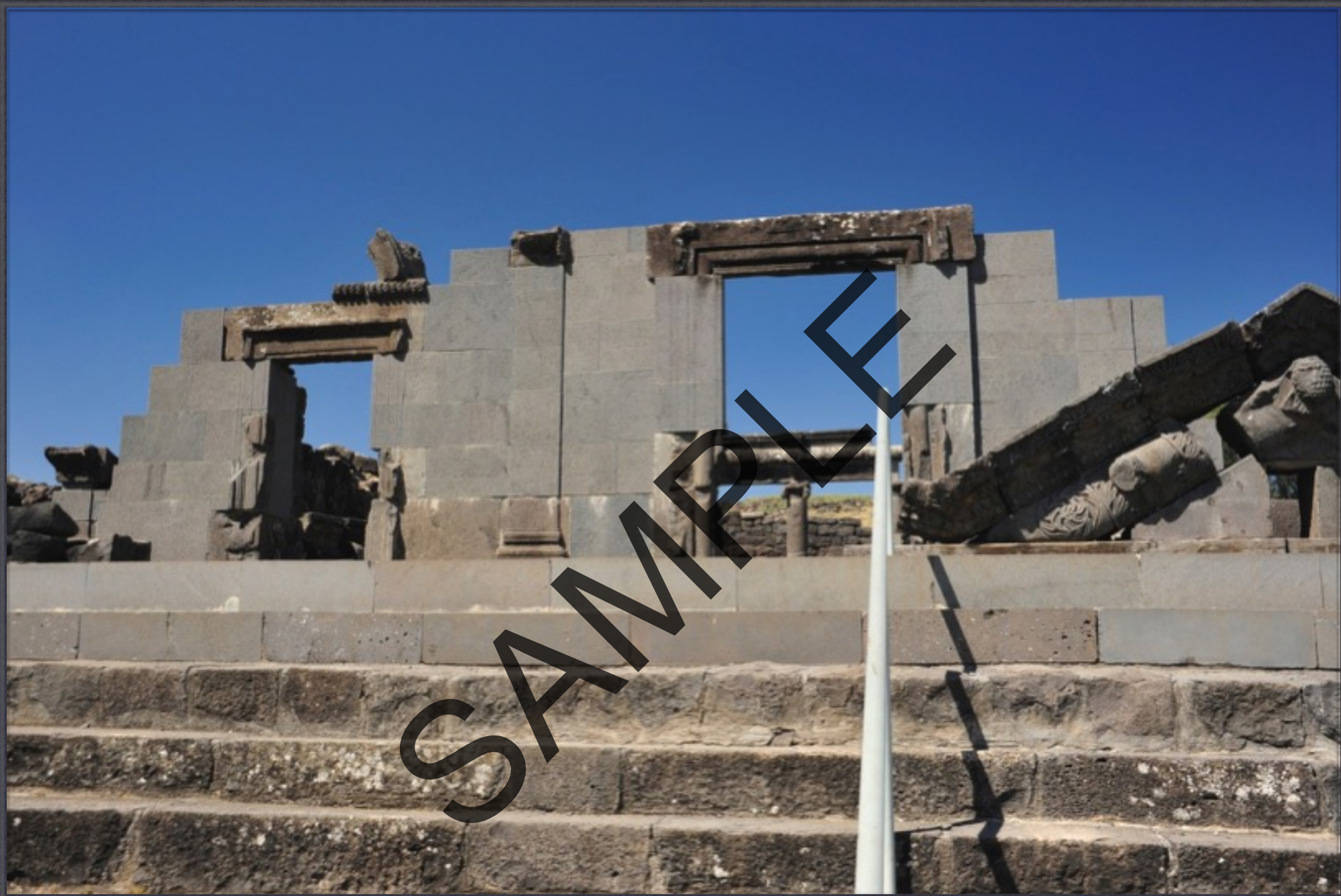
The steps leading up to the synagogue