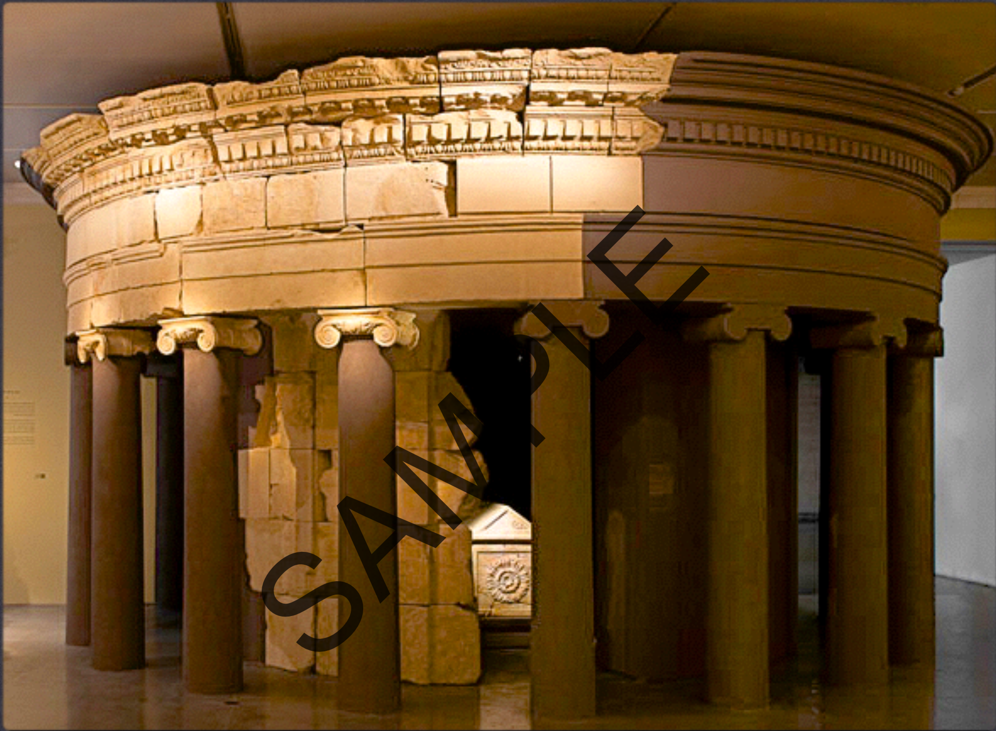
A reconstruction of Herod's tomb in a special display at the Israel Museum in 2013