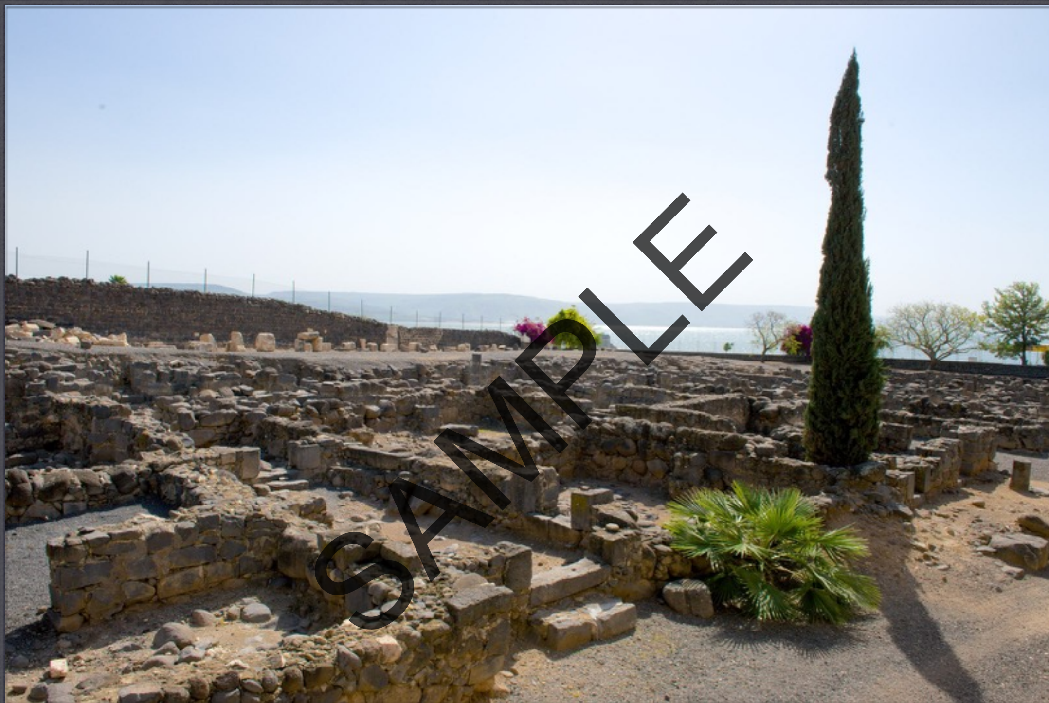
The ruins of Capernaum today