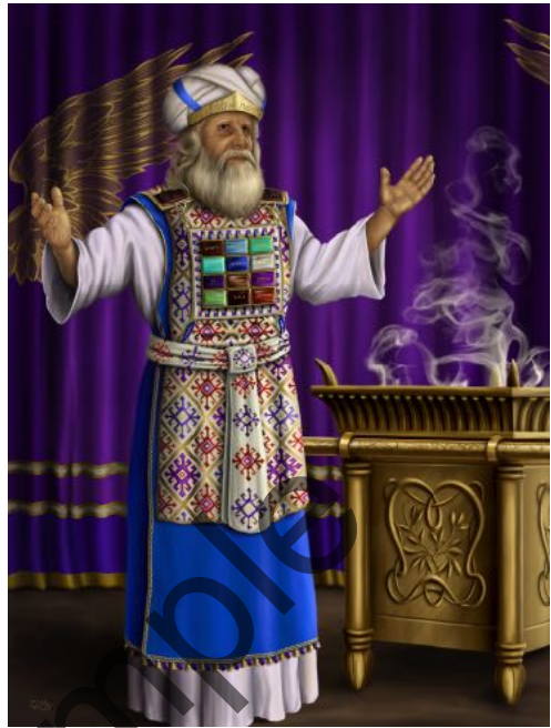
The High Priest