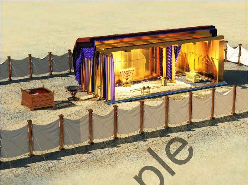
The Holy Place and the Holy of Holies