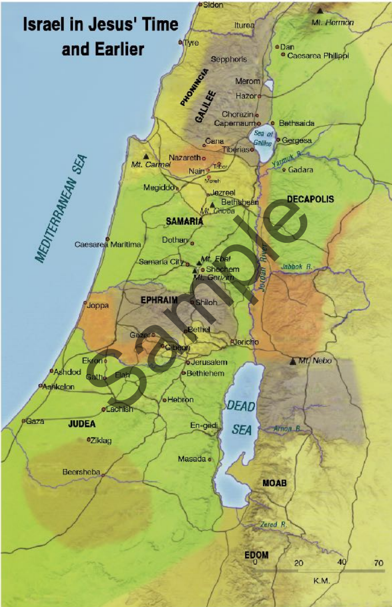
Israel in Jesus' Time and Earlier