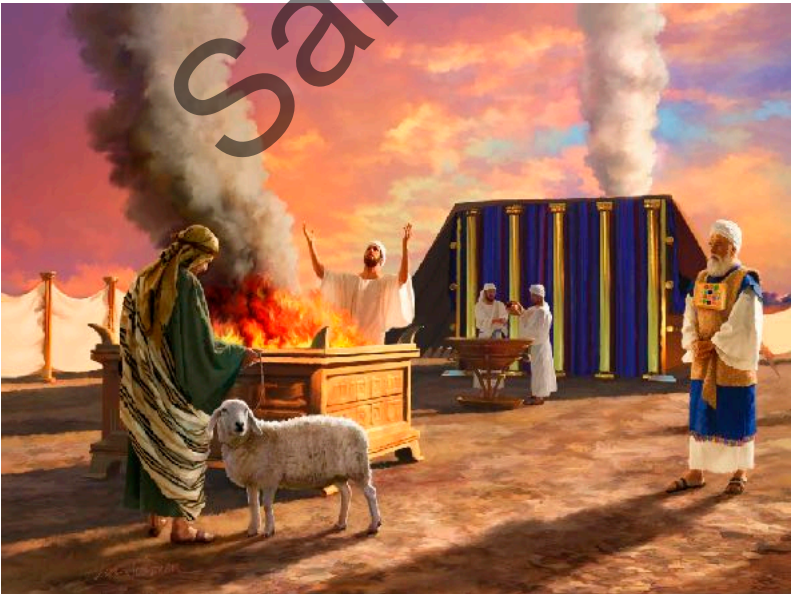
The Alter of Sacrifice