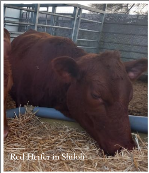
Red Heifer in Shiloh

“This is the ordinance of the law which the LORD hath commanded, saying, Speak unto the children of Israel, that they bring thee a red heifer without spot, wherein is no blemish, and upon which never came yoke” (Numbers 19:2). The Jews who are preparing for the Third Temple are on an endless search for the perfect red heifer from which they can create the water of purification. The search is endless only because they are following rabbinical tradition rather than the Word of God. According to their tradition, without spot or blemish means not one mis-colored hair, not the tiniest imperfection. The Temple Institute has attempted to produce pure red heifers from Texas Red Angus stock for many years. In September 2022, the first red heifers arrived in Israel, but they aren’t perfect enough, a black hair here, a white hair there. The heifers are the central attraction of a new research