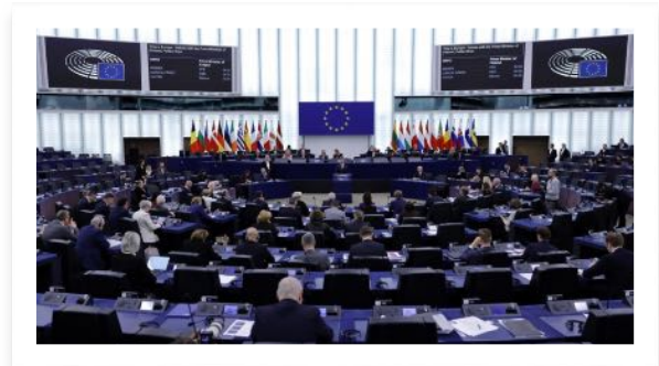
European Parliament 2026