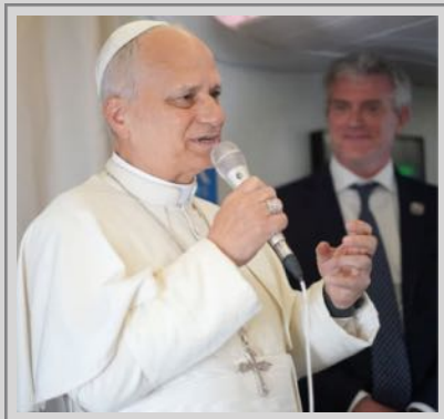
Pope Leo XIV speaks to journalists aboard the papal flight from Malabo to Rome, April 23, 2026

In another example of Rome’s audacity to put its own thinking above God’s Word, Pope Francis revised the Catholic Catechism to oppose capital punishment. In 2018, he called the death penalty “inadmissible because it is an attack on the inviolability and dignity of the person.” In April of this year, Pope Leo XIV said, “I condemn capital punishment. I believe that human life is to be respected and that all people--from conception to natural [death]--their lives should be respected and protected” ( EWTN News , Eternal Word Television Network, May 15, 2026). After Noah’s Flood, God commanded the death penalty for murder. “And surely your blood of your lives will I require; at the hand of every beast will I require it, and at the hand of man; at the hand of every man’s brother will I require the life of man. Whoso sheddeth man’s blood, by man shall his blood be shed: for in the image of God made he man” (Genesis 9:5-6). That has never been rescinded. It was confirmed in the law of Moses (Exodus 21:12; Leviticus 24:17). The New Testament grants civil government the right to bear the sword against evil doers (Romans 13:4).