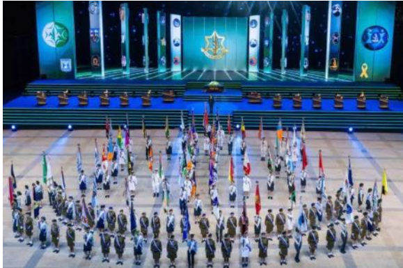
Flag bearers at the torch-lighting ceremony at Mount Herzl.

On Israel's 78th Independence Day ceremony, April 21, Prime Minister Benjamin Netanyahu said Israel has "risen like a lion and fought like one" and "is stronger than ever" ("Under the stars of Mount Herzl," Israel Today , Apr. 22, 2026). He described the current period as a "generation of revival." Netanyahu is smart, courageous, persistent, and has done a lot of good for his nation. But what he does not know, because he is blind to the true meaning of Scripture, is that Israel has been preserved by God in her apostasy and is back in the land in apostasy. This was prophesied in Ezekiel 37:1-14, which describes Israel's return to the land in two stages: first as