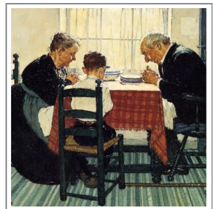
Norman Rockwell painting.

“Because that, when they knew God, they glorified him not as God, neither were thankful...” (Romans 1:21). “Gratitude is not a spiritual or moral dessert which we may take or push away according to the whims of the moment, and in either case without material consequences. Gratitude is the very bread and meat of spiritual and moral health, individually and collectively. What was the seed of disintegration that corrupted the heart of the ancient world beyond the point of divine remedy? What was it but ingratitude?” (Noel Smith). Unthankfulness is an indictment against all men and reveals their sin-ridden, guilty condition. When men say, “Wherein have we sinned so greatly to deserve punishment?” God answers, “By not being thankful to me, by not living every moment of your life in passionate thankfulness.”