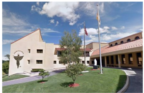
Rosary Hill Home is operated by the Dominican Sisters of Hawthorne in Hawthorne, N.Y.

This situation reminds us that totalitarian wickedness has not gone away because of Donald Trump’s presidency. The only protection is effectual prayer on the part of born-again believers who are on praying ground. The following is excerpted from “Nuns Sue New York,” PJ Media , Apr. 8, 2026: “A group of nuns in New York has taken legal action to, as the Washington Times reports, ‘block a New York transgender-rights law that requires nursing homes to use pronouns, assign rooms and allow restroom access based on a patient’s gender identity, or risk jail time.’ The Dominican Sisters of Hawthorne is an order of nuns who care for indigent terminally ill patients. ... the State of New York threatens to shut