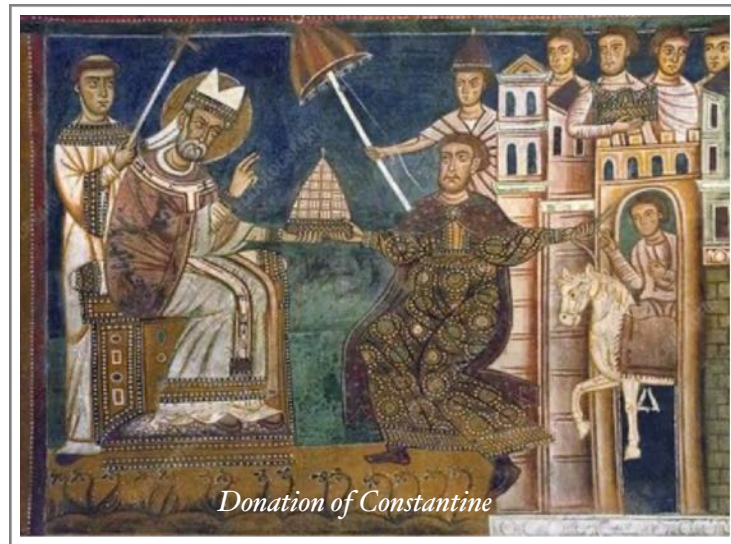
Donation of Constantine