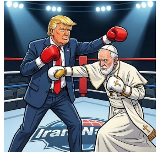
AI Generated image Envato 2026