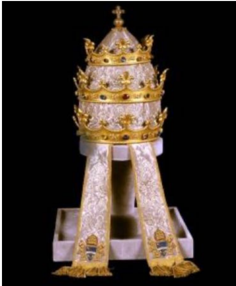
Triregnum (Triple Crown)

The authority claimed by the pope through the centuries is signified by the papal tiara. It is a white helmet-like crown made of gold and silver, ornamented with precious stones and pearls, encircled with three rings, with a small cross at the top. Thus, it was a crown of three crowns. Crowns were worn by popes as early as the 8th century, but they had no rings or only one ring. The three crowns were added gradually. Pope Boniface VIII (1294-1303) added a second circle or crown. Benedict XII, who died in 1342, added the third crown. The triple crown is called the Triregnum (triple rule). The pope was crowned with these words: “Receive the three-fold crown of the Tiara, and know that thou art the Father of princes and Kings, the Ruler of the round earth, and here below the vicar [representative] of Jesus Christ, to whom be Honor and Glory forever, Amen.” It is said that the triple crown signifies the pope as “supreme pastor, supreme teacher, and supreme priest.” This is a blasphemous usurpation of Christ’s offices. Pope Paul VI (r. 1963-1978) was the last pope to wear the tiara, but it is still used to crown the statue of Peter in St. Peter’s Basilica each year and remains a part of the papal coat of arms. (For more on the office and history of the papacy, see The History of the Churches from a Baptist Perspective , 2 volumes, at the Courses section of www.wayoflife.org .)