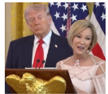
President Trump and Paula White-Cain, April 1, 2026.

At a lunch at the White House on April 1, Paula White-Cain likened President Trump to Jesus Christ. Claiming to speak by divine revelation, she said, “I felt like I was conveying the heart of God for all of us, that we are thankful for the greatest champion of faith that we’ve ever seen in a president. ... the truth of it is, you [Trump] are here because of God and because of you. ... Jesus taught so many lessons through His death, burial and resurrection. He showed us great leadership, great transformation requires great sacrifice. And Mr. President, no one has paid the price like you have paid the price” (“Paula White-Cain likens Trump to Jesus,” Christian Post , Apr. 2,