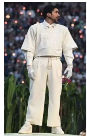
Bad Bunny performing at Super Bowl 2026

The following is excerpted from “Together, We Are Indoctrinated,” The Disntr , Feb. 9, 2026: “At this point, the NFL is little more than a glossy package of political propaganda, marketed to the masses like a sugar-coated sedative. No thanks. I’m not paying to be brainwashed. [I didn’t watch the game] but I did wake up to one heck of a social media hangover. I scrolled through post after post about some clown named ‘Bad Bunny’ who apparently did the halftime show. And within seconds--seconds--I knew exactly what had happened. The images, the captions, the full-on Twitter trench warfare painted a familiar picture. Simulated sex acts, homosexual weirdos in bondage gear, and an absolute onslaught of anti-family sewage beamed straight into American homes. Kids were