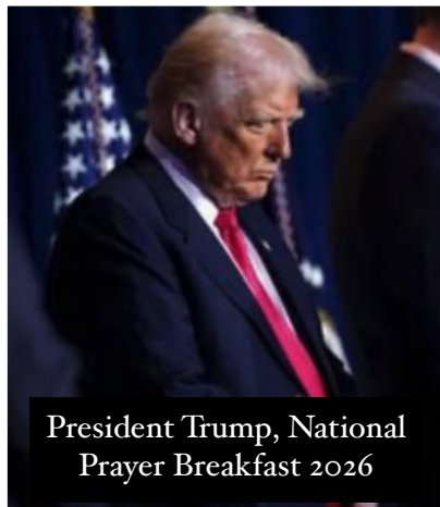
President Trump, National Prayer Breakfast 2026

The following is excerpted from "Trump declares," Israel Today , Feb. 6, 2026: "For the first time in 3,000 years, we have peace,' US President Donald Trump announced at the National Prayer Breakfast on Thursday. 'Now they have to disarm,' he said of Hamas, claiming that the terror group had already agreed to do so. 'Some people say they won't, but they will, and if they don't, they're gonna not be around any longer.' ... Within Israel's security establishment ... there is growing consensus that we