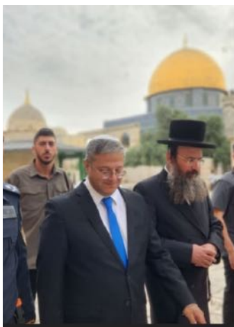
Itamar Ben-Gvir (blue tie) visiting Temple Mount