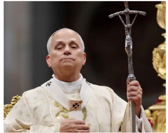
Pope Leo XIV

In yet another misguided peace pursuit by a U.S. President, Donald Trump founded the Board of Peace (BoP) earlier this month to bring peace to Gaza in the short term and to all nations ultimately. The BoP is an evolving, nebulous entity, but the White House official web site stated, "Today, the first steps toward a brighter day for the Middle East and a much safer future for the world are unfolding right before your very eyes" ("President Trump Ratifies," WhiteHouse.gov, Jan. 22, 2026). Invitation letters to 60 or so potential members stated that the BoP will "embark on a bold new approach to resolving global conflict." Trump's son-in-law Jared Kushner said, "If we believe that peace is possible than peace really can be possible" (Ibid.). This is New Age power of positive confession. At the announcement of the formation of the BoP on his own social media forum, Trump called the BoP board "the Greatest and most Prestigious ever assembled at any time, any place" (Truth Social, Jan. 15, 2026). Trump is lifetime Chairman of the BoP, with sole power to appoint and