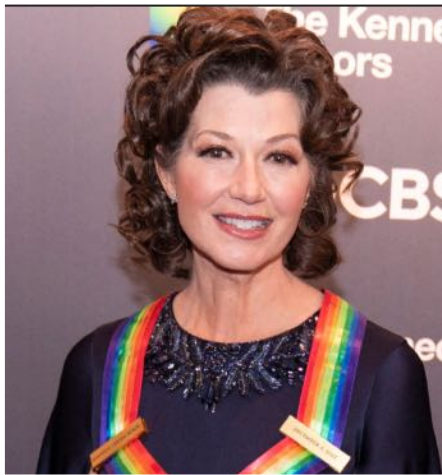
Amy Grant, Kennedy Center

Nothing in my lifetime has done more to produce the apostasy of 2 Timothy 4:3-4 than Contemporary Christian Music, and Amy Grant is one of the most influential figures in the field. In the 1980s, she was one of the first CCM artists to achieve crossover pop success in the secular field by producing "Christian" music without the Christianity. "The Queen of Christian Pop" has achieved wealth and fame, having sold more than 30 million records and won dozens of Grammy and Dove awards. In 2003, she was inducted into the Gospel Music Hall of Fame, and in 2005 she was honored with a star on the Hollywood Walk of Fame. In a new song for 2026, she expressed longing for the 1960s rock & roll culture with its anti-God moral relativism. The song "6th of January (Yasgur's Farm)" refers to the pro-Trump U.S. Capitol demonstration in January 2021 and to the farm on which the Woodstock music festival took place in August 1969. She expresses nostalgia for the spirit of the 1960s, claiming that we have "lost our