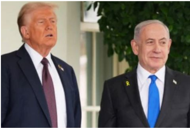
President Donald Trump and Israeli Prime Minister Benjamin Netanyahu at the White House

On September 29, U.S. President Donald Trump and Israel Prime Benjamin Netanyahu announced in a joint press conference the “Comprehensive Plan to End the Gaza Conflict.” Trump said, “Gaza is one thing, but we’re talking about much beyond Gaza. The whole deal, everything getting solved. It’s called peace in the Middle East.” John Hinderaker summarizes the plan as follows: “The war ends; Israeli troops begin to withdraw; hostages, both living and dead, are returned within 72 hours; Israel will release more Hamas terrorists and others; aid will be sent to Gaza; Hamas members who put down their weapons will receive