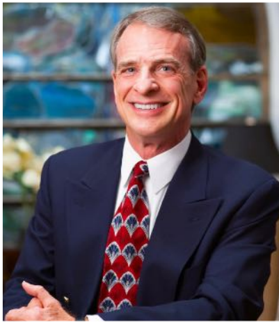
William Lane Craig

Evangelicalism has been deeply corrupted since it renounced “separatism” in the 1940s, began to blend and merge with theological liberalism, and determined to pursue intellectualism and scholarship in the place of simple biblicism. If Peter and John were to appear on an evangelical seminary campus today, they would be considered “unlearned and ignorant men” (Acts 4:13). In pursuit of a Ph.D. with the proper accreditation, the evangelical ignores plain warnings (such as Psalm 1:1; Romans 16:17; 1 Corinthians 15:33; 2 Corinthians 6:14; Ephesians 5:11; Colossians 2:8; 1 Timothy 4:1-3; 6:3-5; 2 Timothy 2:16-18; 3:5; 1 John 4:1; and 2 John 1:8-11) and is unwittingly corrupted by evil associations. He is not careful enough about where he studies, what he reads, what podcasts he hears, who he associates with, etc., because he doesn’t believe in biblical separatism and vaunts his “liberty.”