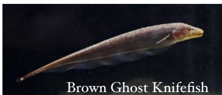
Brown Ghost Knifefish

The following is from CreationMoments.com, August 21, 2025: “The brown ghost knifefish, popular in many aquariums, generates a weak electric signal that it uses for navigation and communication. The electric field they generate is too weak to stun prey. However, the electric organs that run along the sides of their bodies can