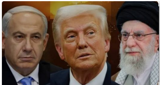
PM Netanyahu, President Trump, Ayatollah Shirazi

The following is excerpted from “Iran Just Declared,” Israel365News , July 3, 2025: “On June 29th, Iran’s most senior religious cleric, Grand Ayatollah Makaram Shirazi, issued a chilling fatwa calling for the global assassination of President Trump and Prime Minister Netanyahu. This isn’t just political rhetoric--this is a direct religious ruling urging Muslims worldwide to carry out targeted killings. Backed by a reward from Allah for anyone who dies attempting the assassination, and brutal punishments for anyone who supports the West, this fatwa reveals the true spiritual and ideological nature of Iran’s war against the West. It is not about land. It is not about borders. It is a religious war rooted in a vision to destroy Israel and America. [These] Islamic rulings have led to real [and attempted] assassinations--from Anwar Sadat to Salman Rushdie. This decree must be taken seriously. This signals a dangerous escalation.”