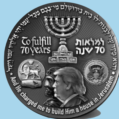
Donald Trump Coin Jewish Temple Mount Israel Half Shekel King Cyrus 70 Years

Israel's Communications Minister Shlomo Karhi told Arutz Sheva ( Israel National News ) that Trump's attack on Iran could herald the coming of the Messiah ("Trump," Arutz Sheva , June 23, 2025). He called Trump "the Cyrus of our times and even greater than that," referring to Cyrus the Great of Persia who in 538 BC opened the door to Israel's return from Babylon and the building of the second temple. Many ultra-orthodox Jews see Trump in