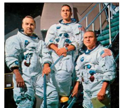
The crew of the Apollo 8 is seen Dec. 18, 1968 (from left): James Lovell Jr., William Anders and Frank Borman.

The following is what three NASA astronauts broadcast to the earth while orbiting the moon on December 24, 1968: “In the beginning God created the heaven and the earth. And the earth was without form, and void; and darkness was upon the face of the deep. And the Spirit of God moved upon the face of the waters. And God said, Let there be light: and there was light. And God saw the light, that it was good: and God divided the light from the darkness. And God called the light Day, and the darkness he called Night. And the evening and the morning were the first day. And God said, Let there be a firmament in the midst of the waters, and let it divide the waters from the waters. And God made the firmament, and divided the waters which were under the firmament from the waters which were above the firmament: and it was so. And God called the firmament Heaven. And the evening and the morning were the second day. And God said, Let the waters under the heaven be gathered together unto one place, and let the dry land appear: and it was so. And God called the dry land Earth; and the gathering together of the waters called he Seas: and God saw that it was good” (Genesis 1:1-10).