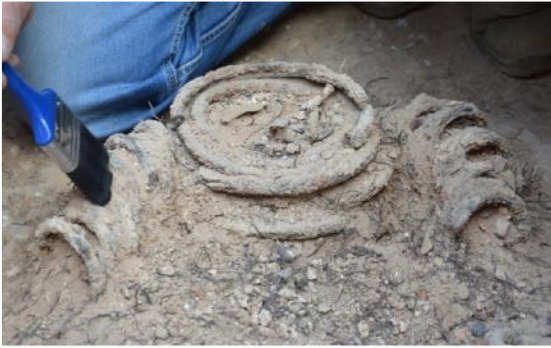
The exposed nun is wrapped with chains