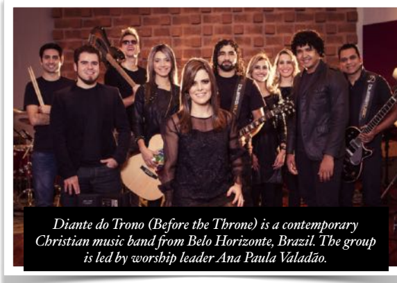
Diante do Trono (Before the Throne) is a contemporary Christian music band from Belo Horizonte, Brazil. The group is led by worship leader Ana Paula Valadao.