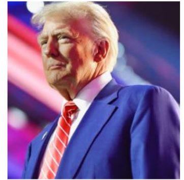
President Donald Trump