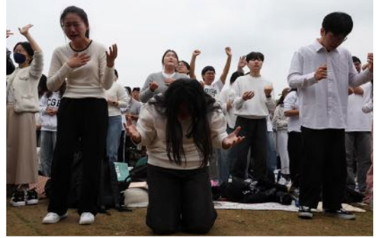
South Korean Christians pray during a massive worship service in protest of the legislation of anti-discrimination bills and same-sex relationships, in central Seoul, South Korea, October 27, 2024.

The following is excerpted from “1 million+,” The Bridgehead , Nov. 12, 2024: “On Sunday afternoon, October 27, as many as 1.1 million South Korean Christians participated in a massive rally in Seoul to express their opposition to homosexual ‘marriage,’ new pro-LGBT legislation, and a supreme court decision conferring some spousal legal rights on homosexuals. Aerial photos show a staggering crowd ... which the Korea Herald described as ‘one of the largest religious gatherings in the country’s history.’ ... According to the Korea Herald : ‘The rally, held in the form of a church service, was against the legalization of [so-called] same-sex marriage and the passage of what participants have claimed is an ‘unjust law’--a legally binding ordinance that would ban [purported] discrimination against an individual based on one’s gender, religion, age, race, academic background or sexual orientation. ... A number of prominent South Korean Christians spoke in support of biblical marriage, and many noted what is unfolding in the West--that we are seeing the replacement of Christian values with the values of the Sexual Revolution. ‘The Christian faith is oppressed in the West, which has comprehensive anti-discrimination laws and where [so-called] same-sex marriage is legal!’ stated one spokesperson. ‘South Korea should remain the last sacred country to never see the passing of anti-discrimination laws’ or homosexual ‘marriage’ legalization.”