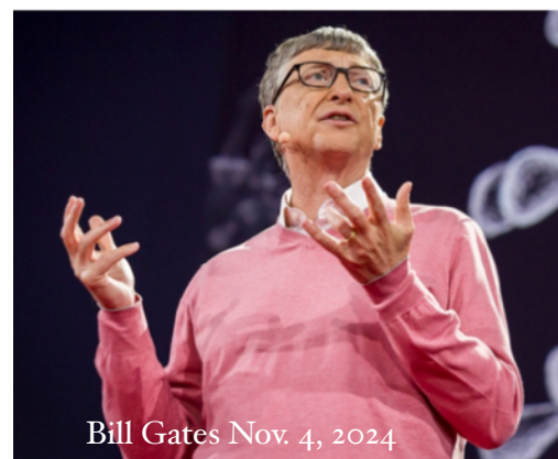
Bill Gates Nov. 4, 2024

In a recent interview, Microsoft founder Bill Gates proposed that AI (artificial intelligence) will solve the world's problems and possibly become a new religion. He said, "The potential positive path [of AI] is so good that it will force us to rethink how should we use our time. You can almost call it a new religion or a new philosophy of how do we stay connected with each other, and not be addicted to these things that will make video games look like nothing in terms of the attractiveness of spending time on them. ... It's fascinating that issues of disease, and enough food, and of climate--if things go well--those will largely become solved problems " (Gates, "Possibility, AI, and Humanity," Reid Hoffman's Possible podcast, Oct. 31, 2024). Bill, whose net worth is said to be $104 billion, is one of the prominent examples of Jesus' warning about a man who gains the whole world and loses his own soul. A voracious reader, he has neglected the one Book that really matters,