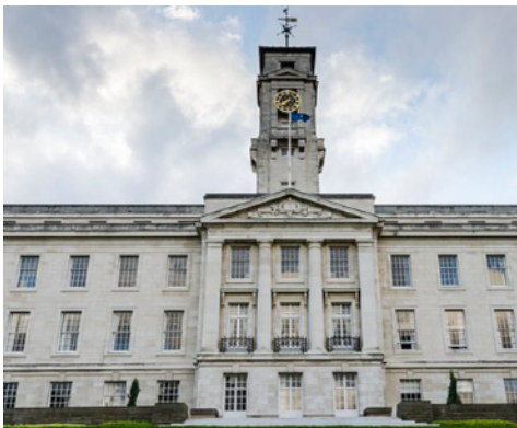
Nottingham University has now been accused of 'demeaning education' for warning students about the religious elements of Chaucer's stories – saying that anyone studying one of the most famous works in English literature would hardly have to have the Christian references pointed out

The following is excerpted from "University Puts Trigger Warning," The European Conservative , Oct. 15, 2024: "A leading UK university has been strongly criticised for putting a trigger warning on Geoffrey Chaucer's Canterbury Tales advising students that the work contains 'expressions of Christian faith.' Critics say the University of Nottingham is 'demeaning education' for warning students that the Medieval collection of stories of pilgrims on their way to Canterbury Cathedral may contain Christianity. ... The Canterbury Tales is one of the most famous works of Medieval English literature. It is a collection of stories about various characters on their way to the tomb of Saint Thomas Becket, then one of the most popular pilgrimage sites in Europe. The stories also contain explicit