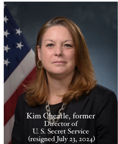
Kim Cheatle, former Director of U. S. Secret Service (resigned July 23, 2024)