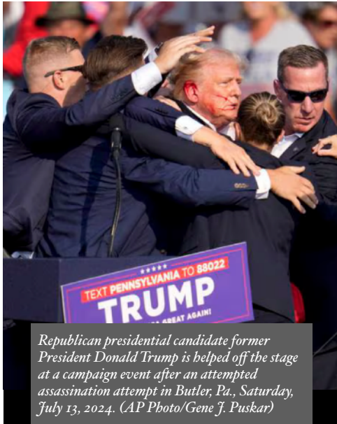
Republican presidential candidate former President Donald Trump is helped off the stage at a campaign event after an attempted assassination attempt in Butler, Pa., Saturday, July 13, 2024.

Donald Trump survived an attempt on his life on July 13 at a political rally in western Pennsylvania. The well-aimed deadly head shot only pierced Trump's ear when he moved his head at the very moment that the bullet reached him. I wept in gratitude for Trump's survival. We have often prayed for his safety and for his salvation. An attempt on Trump's life was almost inevitable in light of the hatred that has permeated large parts of American society, driven by the lies and false narratives that have been shouted from social media housetops. I can love Trump and want the best for him, and I can appreciate his warrior spirit, even while recognizing the truth of everything we said about him in last week's Friday News. We pray that this event will result in the toning down of some of the dangerous left-wing demonization. It seems to have had that effect temporarily to some extent. By God's mercy, America escaped an event that would have had massive and terrible consequences.