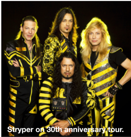
Stryper on 30th anniversary tour.