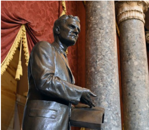
Statue of Billy Graham in U.S. Capitol

A larger than life statue of Billy Graham (1918-2018) was unveiled in the U.S. Capitol this week. It was placed there by North Carolina, Graham's home state, as one of two statues each state is allowed in the National Statuary Hall Collection . It replaces a statue of former governor Charles Aycock. Graham is the most influential evangelist of the 20th century. The seven-foot-tall statue depicts Graham pointing to an open Bible and includes the verses John 3:16 and John 14:6. It is wonderful to have yet another testimony to the Bible as God's Word in the U.S. Capitol and to the gospel of Jesus Christ. At the same time, the reality is that Billy Graham did so much to tear down the biblical walls of separation between truth and error, between the sound gospel and false gospels. By his refusal to practice biblical separation, he was a preeminent builder of the end-time one-world "church." He turned multitudes of seekers over to the Roman Catholic Church and other apostate entities. His presence in the U.S. Capitol glorifies end-time apostasy at least as much as it glorifies the Bible. (See the free eBook Billy Graham and the One-world Church , https://www.wayoflife.org/free_ebooks/billy_grahams_disobedience.php .)