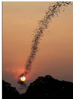
Massive Bat colony in flight