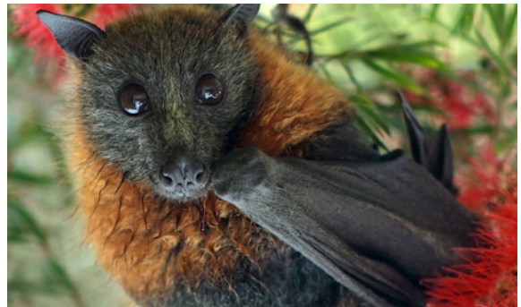
Fruit Bats of Cairns Australia