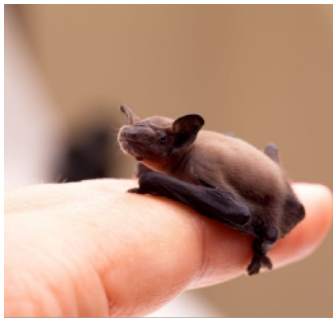
Kitti's hog-nosed bat

million members. Bats are beneficial to both humans and nature. Many of the bats found in North America, as well as other parts of the world, are responsible for consuming thousands of tons of insects every night. Other bats pollinate flowers. Bats are also an essential link in the ecosystem that makes the rainforest possible. The earliest bats found in the fossil record are like bats today. They are fully formed with fully developed wings for flight. This means that there is not one scrap of fossil evidence to support the claim that bats evolved from some other creature. We can conclude that the scientific evidence says that bats were created pretty much in their present form by God. Ref: ‘Silent screamers.’ Science Digest , May 1984. p. 57.”