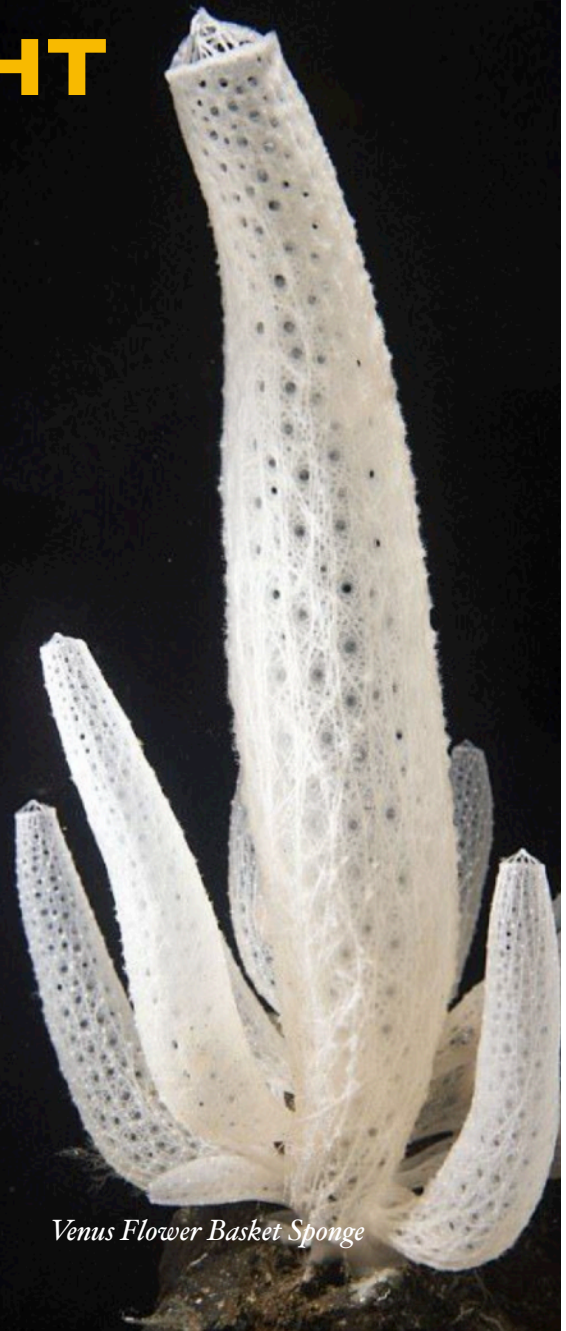
Venus Flower Basket Sponge