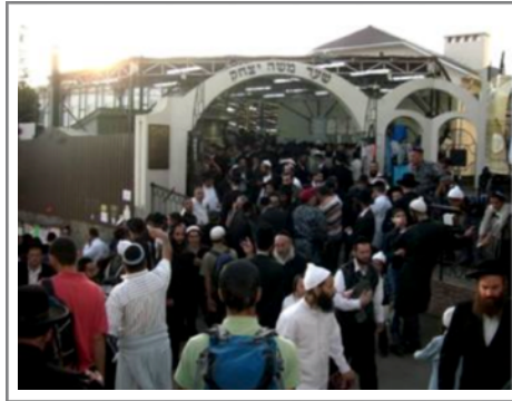
Pilgrimage to Rebbe Nachman's Grave at Rosh Hashanah in Uman, Ukraine

from a small movement into the largest and most widespread Jewish movement in the world today.” Schneerson’s photo is plastered on signs and walls in many parts of Israel. It is often accompanied with a crown and the Hebrew word Mashiach (Messiah). According to ultra-Orthodox thinking, the Messiah is the man who will build the third temple. Rabbi Nachman of