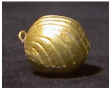
Golden Bell Found by Archaeologists

In 2011, a small golden bell with a tiny loop at its top was found by archaeologists excavating the ancient drainage channel that ran beneath the Pilgrim's Way from the Pool of Siloam to the western side of the Temple Mount. The bell is very likely one that was made for the high priest's robe. There is no mention in the Bible or in extra-biblical Jewish historical records of a golden bell like this used in any other fashion. Attached to the hem of the high priest's beautiful blue robe were pomegranates of blue, purple, and scarlet, and golden bells (Ex. 28:33-35). The gold bells signify, first, Christ's deity. He is God and He is man and as such He can be the Mediator between God and man. This work was signified on the day of atonement when the high priest carried the blood of the sacrifice into the holy of holies and applied it to the ark and the mercy seat (Leviticus 16). Second, the bells signify the Father's delight in the Son. The bells related particularly to the high priest's work in the Holy Place which was to the Father. Of Christ, the Father said, "This is my beloved