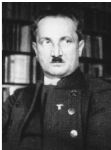
Martin Heidegger 1933

The following is excerpted from "The Treason," Niall Ferguson, The Free Press , Jan. 25, 2024: "It might be thought extraordinary that the most prestigious universities in the world should have been infected so rapidly with a politics imbued with antisemitism. Yet exactly the same thing has happened before. A hundred years ago, in the 1920s, by far the best universities in the world were in Germany. By comparison with Heidelberg and Tübingen, Harvard and Yale were gentlemen's clubs, where students paid more attention to football than to physics. More than a quarter of all the Nobel prizes awarded in the sciences between 1901 and 1940 were awarded to Germans; only 11 percent went to Americans. Albert Einstein reached the pinnacle of his profession not in 1933, when he moved to Princeton, but from 1914 to 1917, when he was appointed professor at the University of Berlin, director of the Kaiser Wilhelm Institute for Physics, and as a member of the Prussian Academy of Sciences. Even the finest scientists produced by Cambridge felt