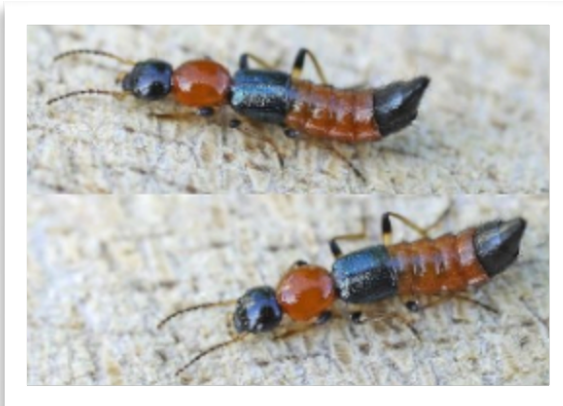
Large-eyed Rove Beetle

The following is from CreationMoments.com, November 28, 2023: "Imagine a beetle that can move across the surface of water without any body movement. Some creatures have been given such ability and skill that it should be clear to even the most skeptical person that their Maker and Teacher is greater than any human being. One such creature is the large-eyed rove beetle. Like many other insects, this beetle can walk on water. The surface tension of the water is enough to support the beetle on top of the water, given the special structure of his legs and feet. Should you see the large-eyed rove beetle, you will notice that he moves across the water, stops, turns, and starts up again without moving any part of his body. How does this work? The large-eyed rove beetle