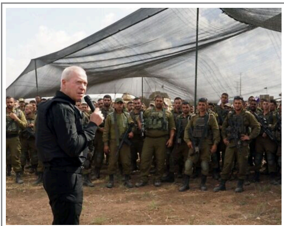
Defense Minister Yoav Gallant speaks to troops near the Gaza border, October 19, 2023.

There is no clearer evidence of Israel's current apostate condition than its acceptance of homosexuality and same-sex "marriage." Israel recognizes same-sex marriages from other nations and allows homosexual couples to adopt. Tel Aviv's annual gay pride festival is one of the largest in the world. Jerusalem has its own gay pride festival, fulfilling the prophecy of Revelation 11:8 which calls Jerusalem "Sodom." The following is excerpted from "Same-sex partners of fallen troops," Israel21c , Nov. 12, 2023: "Israel's Knesset recently passed an amendment that allows recognition of same-sex partners of fallen soldiers as IDF widows or widowers. The existing law was amended after