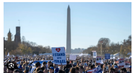
Massive pro-Israel rally held in Washington

The following is excerpted from “Massive pro-Israel rally,” The Washington Times , Nov. 14, 2023: “Tens of thousands of demonstrators assembled on the National Mall in Washington on Tuesday to show support for Israel and to condemn mounting antisemitism as the Jewish state wages war against the terrorist organization Hamas in Gaza. Called the ‘March for Israel’ and organized by the Jewish Federations of North America and the Conference of Presidents of Major American Jewish Organizations, the rally’s purpose was to show solidarity and support for Israel and its people. The gathering was in response to those still being held by Hamas since its deadly Oct. 7 attack against Israel, in which terrorists killed about 1,200 civilians and abducted about 240 hostages back to Gaza. The massive crowd waved Israeli and American flags, signs announcing their respective city’s support for Israel and laminated posters of kidnapped hostages. They chanted ‘Bring them home.’ Attendees came from all over the country and told The Washington Times that the recent events in Israel and attacks on Jewish Americans in the U.S. motivated them to show up.”