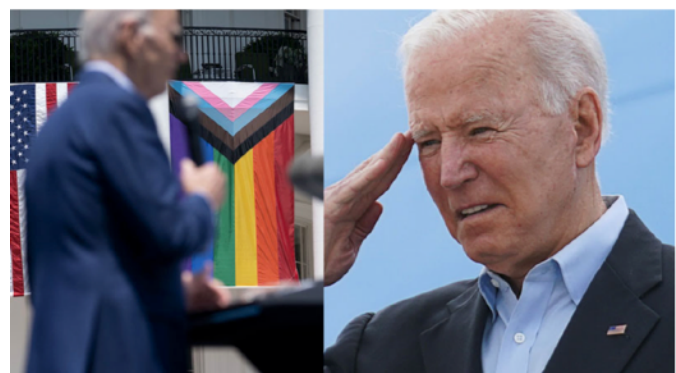
President Joe Biden