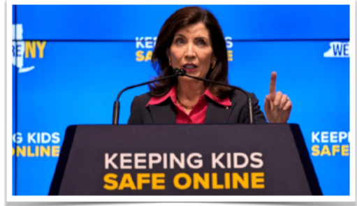
New York Gov. Kathy Hochul speaks during a news conference in New York, Wednesday, Oct. 11, 2023.

Other states are Utah, Texas, and Indiana. If the world sees great danger in social media, how much more should Bible-believing parents and churches! (See the book Spiritual Safety in the Facebook Age , https://www.wayoflife.org/publications/books/spiritual_safety_in_the_facebook_age.php .)