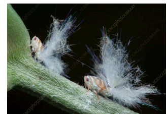
Larval Plant Hoppers

LARVAL PLANT HOPPERS use a different form of deception. They attach themselves in groups on branches, orienting their frilly and feathery bodies together so they look like a flower! The clever forethought and planning involved in nature's deceptions rule out any thought that these creatures designed themselves. Ref: 'Four masters of deceit,' National Geographic , Mar. 1980, p. 410."