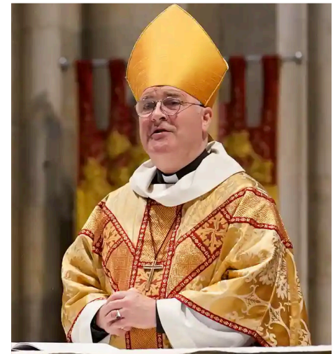
Archbishop Stephen Cottrell