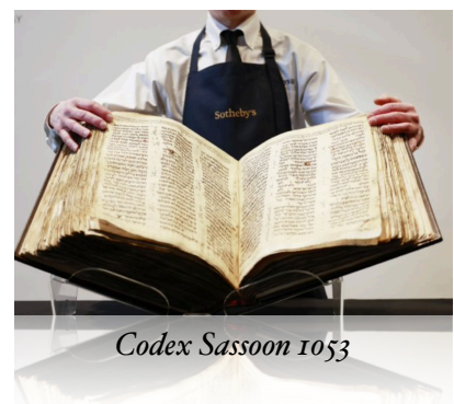
Codex Sassoon 1053