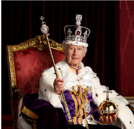
Britain's King Charles III poses for a portrait in Buckingham Palace's Throne Room dressed in full regalia. He is wearing the Robe of Estate and the Imperial State Crown while holding the Sovereign's Orb and the Sovereign's Sceptre with Cross.

Charles III, newly crowned king of England, is the well-fitted head of the apostate Church of England. He makes no profession of personal faith in Jesus Christ as Lord and Saviour. He is a radical environmentalist who serves the creature more than the Creator. He holds to the myth of man-made climate change (including pushing global depopulation) while rejecting the Bible as the infallible Word of God. His coronation on May 6 featured a Roman Catholic cardinal, plus Buddhist, Hindu, Jewish, Muslim, and Sikh leaders, not as guests but as participants ("The Last Christian King?" Religion News Service , May 5, 2023). "It is the first time in nearly 500 years that Catholic prelates were present at a Coronation, in marked contrast to 70 years ago, when Catholics were not permitted to attend any services in a Protestant church" ("Catholic Cardinal," Zenit.org , May 6, 2023). Hindu Prime Minister Rishi Sunak read a