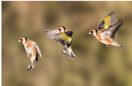
Goldfinch Flight Path

The following is from CreationMoments.com: “You are the pilot of a Boeing 767 airliner, bringing the great ship in for a landing. Approaching the airport, you extend the slat on the leading edge of each wing so that you have more lift as your speed slows. As the runway nears, you raise the nose of the plane to catch more air. In the final moments of landing, you bring the feathers, which act as air brakes, out of the wing to reduce your lift and settle easily onto the runway. Yet, without any training, young birds do this very same thing every day. High-speed