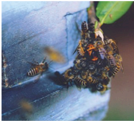
Honeybees mob an invader wasp, revving up their body heat until the attacker dies.

The following is from CreationMoments.com, Mar. 30, 2023: "When bees are threatened by some diseases or predators, they act like sick children--they get a fever. More specifically, they give their nest a fever, sometimes raising its temperature to levels nearly fatal to themselves. Bees are cold-blooded, but they can generate heat by flexing their flight muscles while holding their wings still. It has long been known that bees can generate temperatures as high as 96.8° (F) to keep the nursery nice and cozy. Researchers have found that this ability is used to cure a sick hive. One of the more dangerous threats to the bees' nest is the chalkboard fungus. Researchers noticed that bees raised the temperature of the nursery when threatened with the fungus. They then tested the effect of the temperature increase by introducing