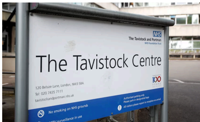
Tavistock transgender clinic shut down by NHS after review finds it is ‘not safe’ for children (telegraph.co.uk, 28 July 2022)

transgender clinic in England, closed due to concerns that doctors were performing surgeries without considering children’s mental health--a practice that is far too common here in the United States. A few months later, the National Health Service (NHS) banned puberty blockers in most cases and no longer recommends social transitioning for kids. In fact, the United Kingdom, Finland, and France have all dialed down their pushing transgender ‘treatments’ for children. So has Sweden, which abandoned recommending gender transitioning for children in December, arguing that the first line of treatment should be psychosocial support--not giving kids dangerous drugs and mutilating their bodies. This week, the Norwegian Healthcare Investigation Board followed suit. Europe is seeing the light on this dangerous assault on children, and they’re looking at the United States and wondering why we’re so nutty. It’s true; the editor-in-chief of The British Medical Journal , Kamran Abbasi, just pushed back against the gender-affirming care model that has become all the rage in America.”