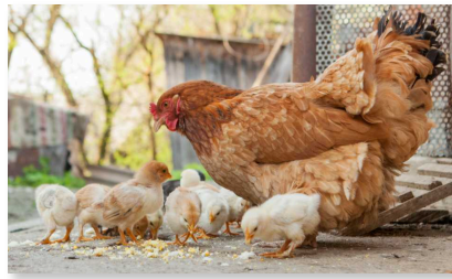
Israeli researchers say they have developed a way of gene-editing hens to prevent the slaughter of male chicks

The following is excerpted from “Golda, the Israeli Hen,” Israel21c.org, Dec. 28, 2022: “Every year, the global egg industry ‘culls’--suffocates or grinds to death--six to seven billion male chicks. The males are commercially useless because they cannot lay eggs and aren’t the right breed for meat. Though many countries have pledged to find alternatives to this gruesome practice, proposed solutions are not always cost effective and often require egg producers to purchase, install and learn how to use new equipment. ... Now offering a different approach is the Israeli molecular biology company Huminn: a