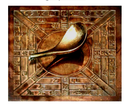
A Han dynasty magnetic compass