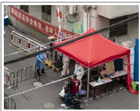
A delivery worker at an entrance to a neighborhood placed under lockdown due to Covid-19 in Shanghai, China, on Wednesday, Oct. 26, 2022.

The following is excerpted from “Millions in China Are Back under Lockdown,” PJMedia , Oct. 28, 2022: “China is one of the few nations remaining that is clinging to the ‘Zero Covid’ policy of massive testing and draconian lockdowns whenever an outbreak of the virus is detected. And with winter coming, Chinese citizens are bracing themselves for more unprecedented measures to try and stop the outbreak in its tracks. Currently, more than 200 million people are under total lockdown--no shopping, no work, not even a walk in the park. ... [On the] occasion of the party congress that ended last week ... President Xi made it clear that the nation would redouble its efforts to control the pandemic by locking down the county and isolating its people ... Aside from maintaining a policy that has failed everywhere else it’s been tried, China is stuck in Covid hell.”