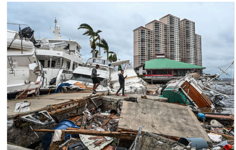
Residents inspect the damage to a marina in the aftermath of Hurricane Ian in Fort Myers, Florida, on Sept. 29.