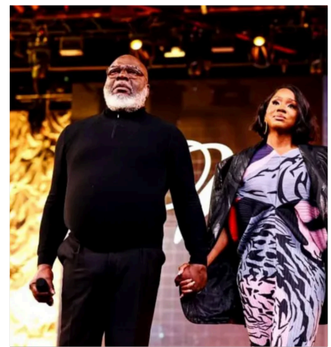
Bishop T.D. Jakes & daughter, Sarah Jakes Roberts

On Sept. 24, T.D. Jakes, pastor of Potter's House church in Dallas, anointed his daughter, Sarah Jakes Roberts, with oil to "empower" her to take the reins of the Woman, Thou Art Loosed ministry with its annual conferences (now called Woman Evolve). Jakes said, "As Samuel's horn of oil anointed David, I so anoint you." She was "slain in the Spirit" and lay on the stage while Jakes said to the crowd, "I want every woman in this room to lift up your hands and to receive the anointing of God." Sarah co-pastors two branches of the Potter's House (Los Angeles and Denver) with her husband Touré Roberts. She had an out-of-wedlock pregnancy at age 13, and her first marriage at age 19 ended in divorce ("T.D. Jakes' Daughter," Church Leaders , Sept. 26, 2022). Jakes is a Church of God in Christ motivational speaker and pastor of a megachurch in Dallas, Texas. His book Woman, Thou Art Loosed has sold millions of copies. He preaches a positive, self-esteem, "it's all about you"