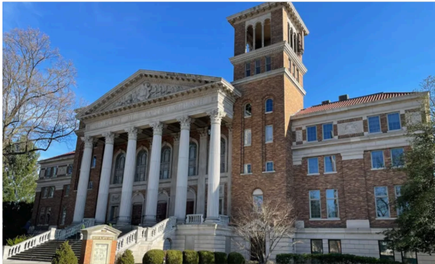
Crescent Hill Baptist Church, Louisville KY