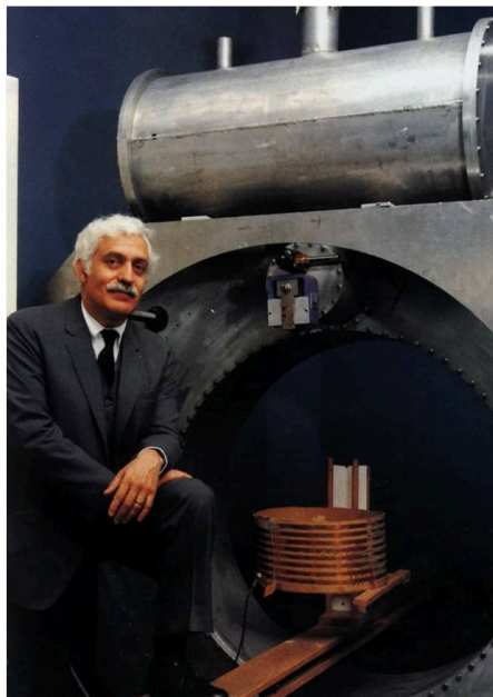
Raymond Damadian, inventor of the MRI

Noted Christian inventor Raymond Damadian passed away on Aug. 3. He was 86. Dr. Damadian, biophysicist, was the recipient of the Lemelson-MIT Achievement Award as “the man who invented the MRI scanner.” In 1988, he was awarded the National Medal of Technology, America’s highest award for applied science, and a year later, he was inducted into the Inventors Hall of Fame, an honor he shared with Thomas Edison, Samuel Morse, and the Wright Brothers. The first MRI scanner that Dr. Damadian and his colleagues built in 1977, “The Indomitable,” resides at the Smithsonian Institution in Washington, D.C. In a 2012 interview, Dr. Damadian was asked, “Why do you believe that the Bible is true?” He replied, “If you take the trouble to examine the evidence supporting the Bible and contradicting alternative theories, from my perception, the evidence is overwhelmingly in support of the biblical record and vacates alternative thoughts such as evolution. The evidence for evolution is