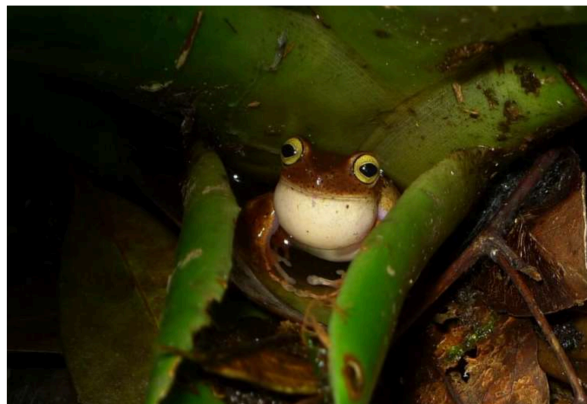
Adult male vocalizing in a bromeliad leaf tank.

The following is from creationmoments.com, December 1, 2021: “Even though many frogs live much of their lives out of the water, they need water to reproduce. This can be a problem since some frogs live in trees and some even live in the desert! For a tree frog, the trip from the treetops to a nearby pool is a long and dangerous journey. However, the Creator cares about all of His creatures. The leaves of the bromeliad that grows in the branches of many trees in the tropical forest form a private pool far above the ground. As a result, mama frog can raise her young without ever leaving the