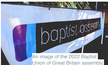
An image of the 2022 Baptist Union of Great Britain assembly.

The Baptist Union of Great Britain is considering changing its rules to allow its ministers to contract marriage with people of the same sex. “In a communication with its churches, it confirmed a request was made in 2020 by 70 members--the majority of which are ministers. The request asked that the Ministerial Recognition Rules be changed to remove a line which says that marriage is defined as ‘exclusively between a man and a woman.’ ... In a long letter addressing the issue, Baptist Union general secretary Lynn Green said: ‘A number of conversations and a consultation will take place in the coming months but no time scale has been provided. The Baptist Union has, however, confirmed that no decision will be made at the Council meeting in October’” (“Baptist Union to Consider,” Premier Christian News , June 22, 2022). This measure probably won’t be officially approved, but it would not even be entertained if Baptist Union pastors were true Bible